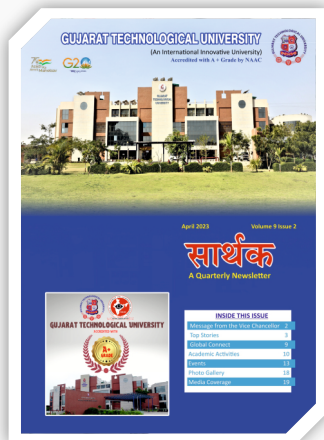
VOLUME 9 ISSUE 2