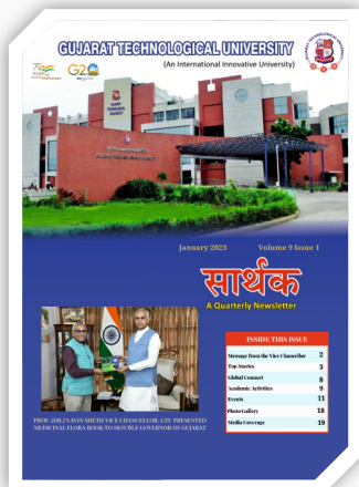
VOLUME 9 ISSUE 1

Every year GTU publishes a quarterly newsletter 'SARTHAK'. In the year 2023, 4 issues of the newsletter were published which are available on GTU website.