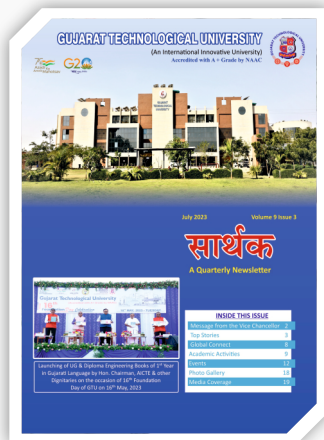
VOLUME 9 ISSUE 3