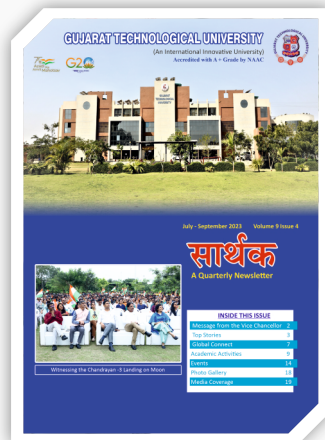
VOLUME 9 ISSUE 4